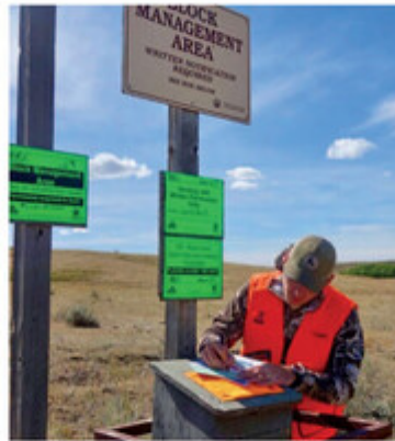
One bill that passed allows qualifying landowners to now earn up to $50,000 each year in compensation for granting public hunting access through the popular Block Management Program.