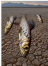
Montanans can't make more rain or snow, but all of us can conserve water to keep as much moisture on Montana's landscape as possible.