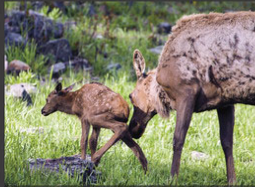
A cow helps her newborn calf stand. If this young elk survives its first winter, biologists consider it to have "recruited" into the population.

Many things affect recruitment rates, which with elk are measured each spring by the number of calves per 100 cow elk (such as 10:100, a low recruitment rate, or 40:100, a high rate). These include whether a cow even becomes pregnant in the fall, the condition of a pregnant cow during winter and spring (which affects the health of the newborn calf), the number of predators in an area, and