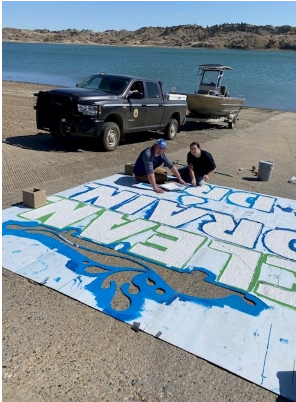
Hell Creek State Park boat ramp