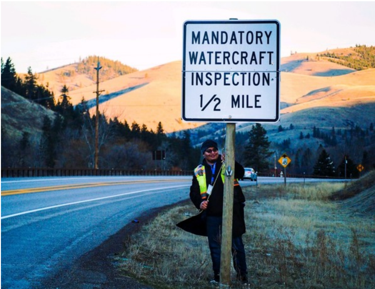
CSKT watercraft inspector at Ravalli station

Other inspections stations operating this summer include Glacier National Park, Yellowstone National Park and Whitefish Lake. All of these partners work closely with FWP to ensure a consistent and coordinated state-wide effort.