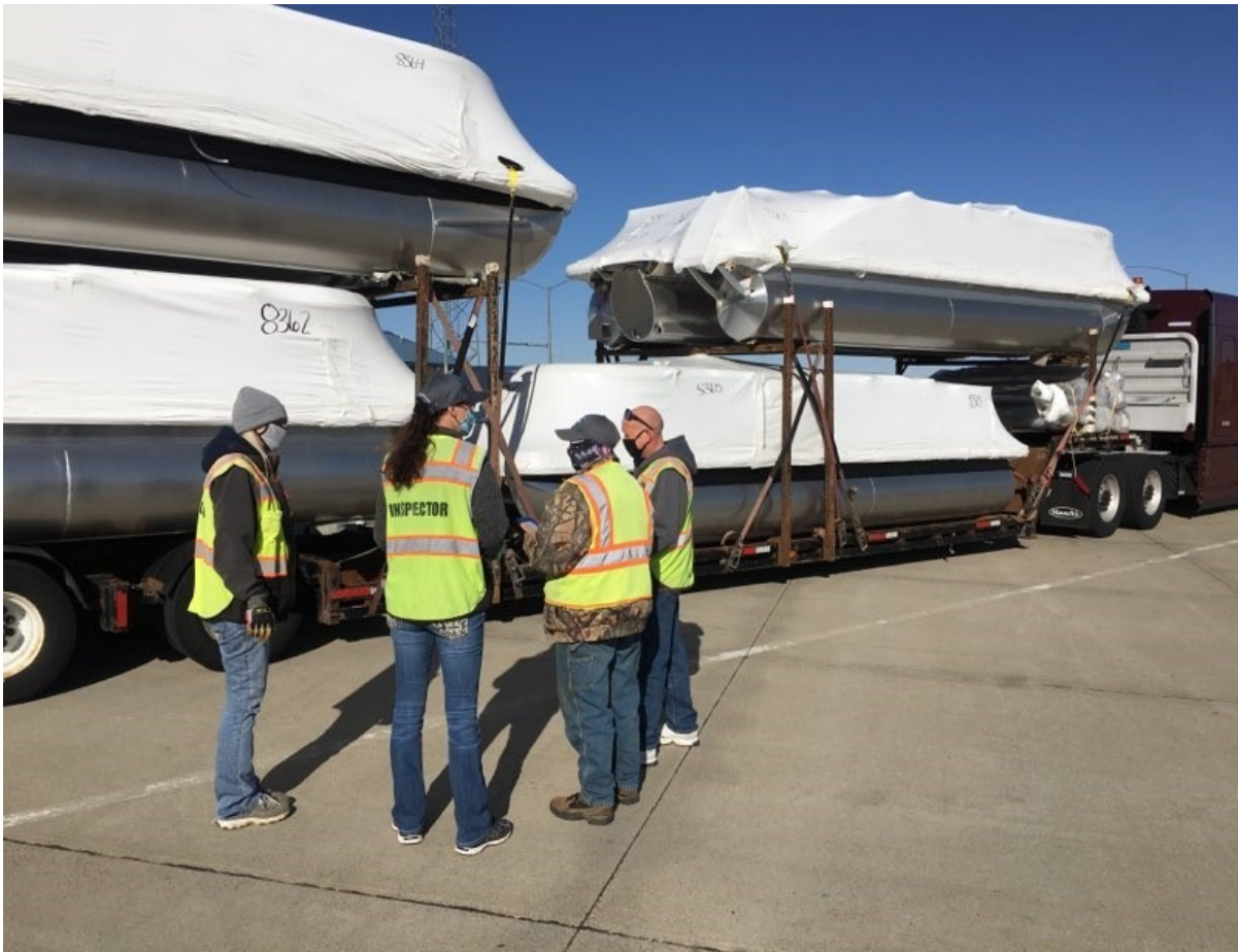
Garfield County Conservation District watercraft inspectors at Wibaux station