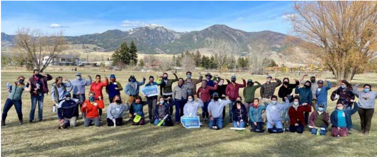
Big Sky Watershed Corps member AIS training in Bozeman

understanding of AIS issues they can share with their host organizations and constituents.