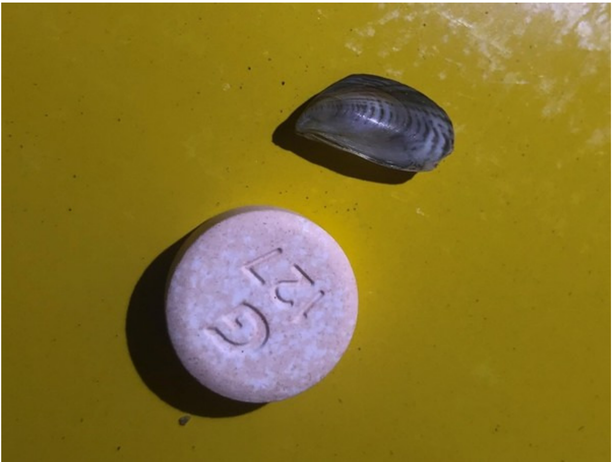
Mussel boat #4 returning to Montana from Lake Powell