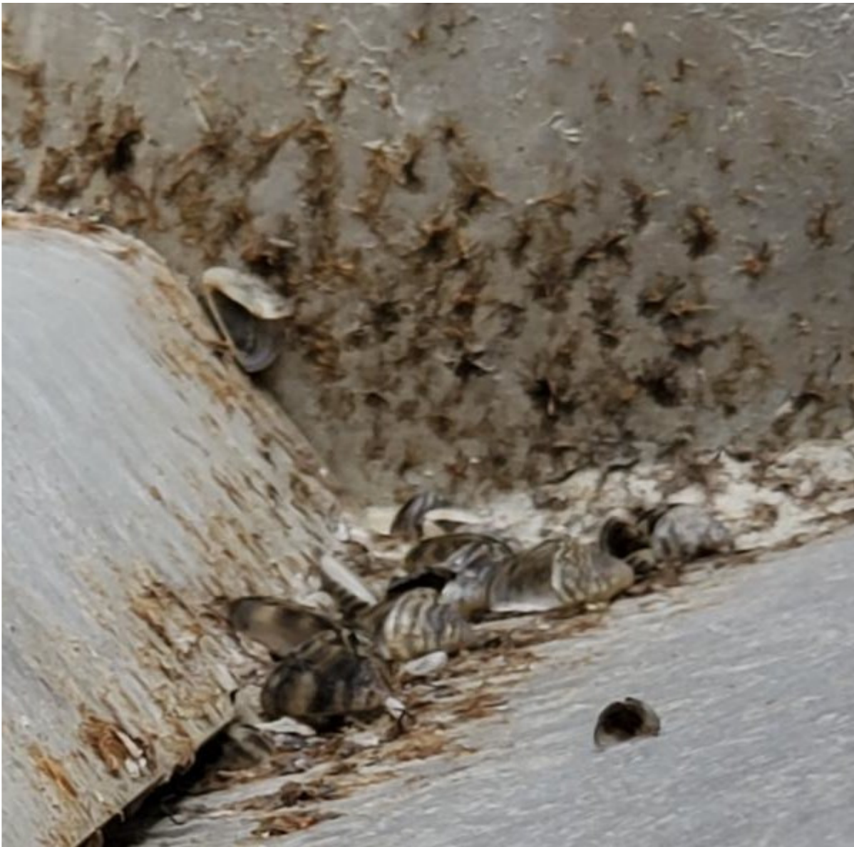
Mussel boat #6 from Minnesota en route to Spokane