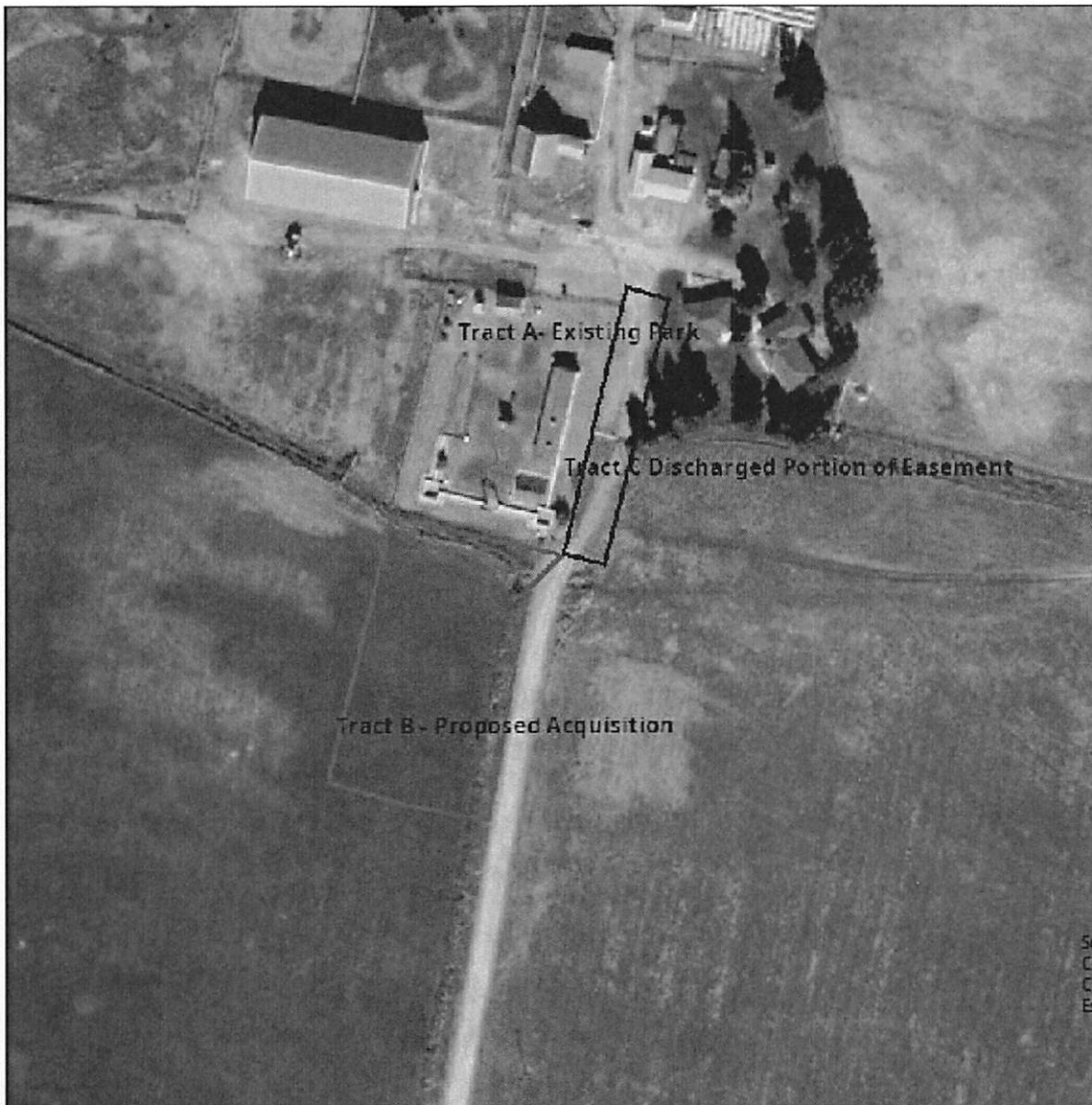
Approximate boundaries of the proposed addition (Tract B, red line) to existing Fort Owen State Park (Tract A) and the portion of access easement to be discharged (Tract C, blue line).