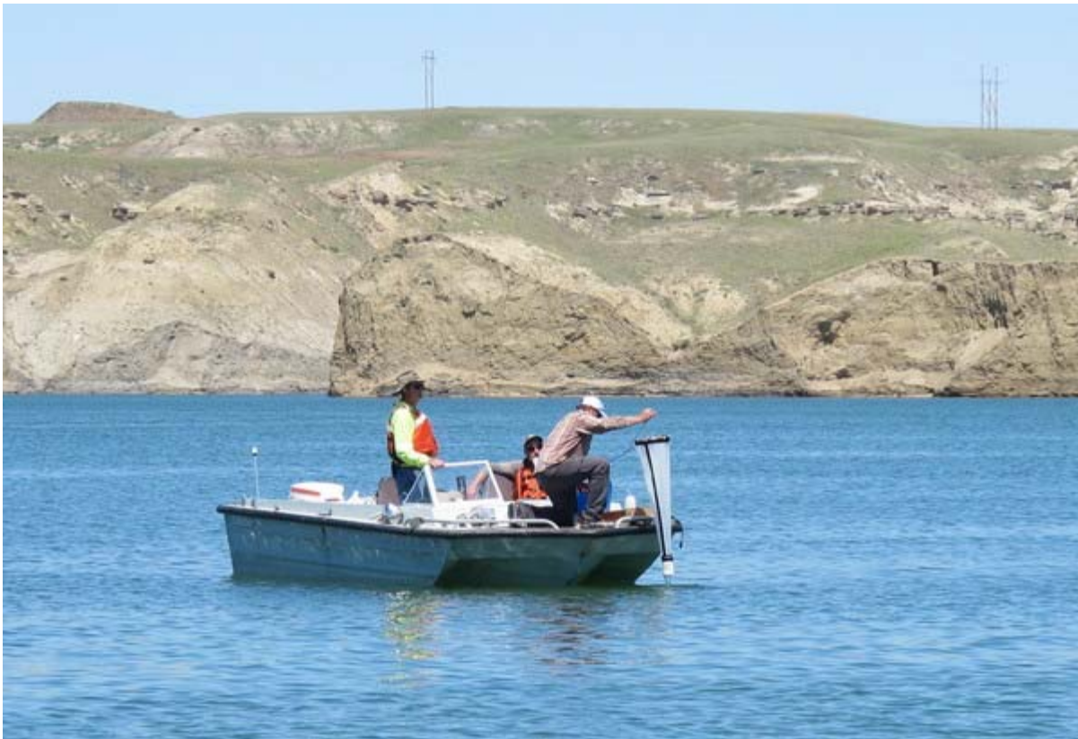
Sampling at Tiber Reservoir