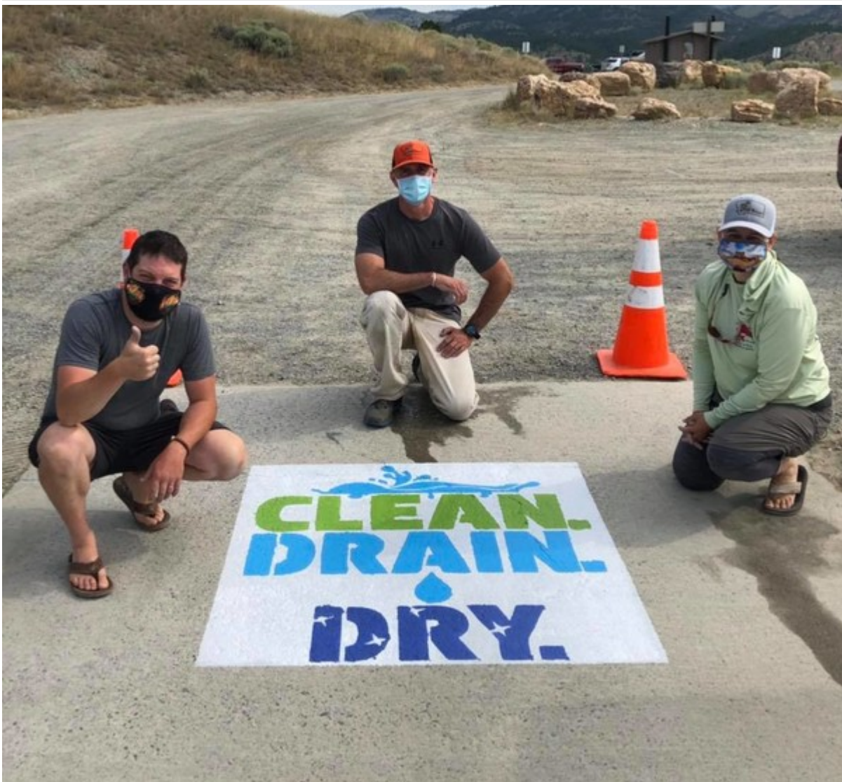
TU volunteers at the Shannon boat ramp.

Montana Trout Unlimited: Working with area resource managers, TU is stenciling the “Clean-Drain-Dry” message on boat ramps and other structures around the state, including at the Clearwater Junction inspection station and the Shannon boat ramp at Canyon Ferry.